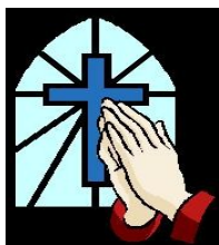
Praise and Prayer Gathering